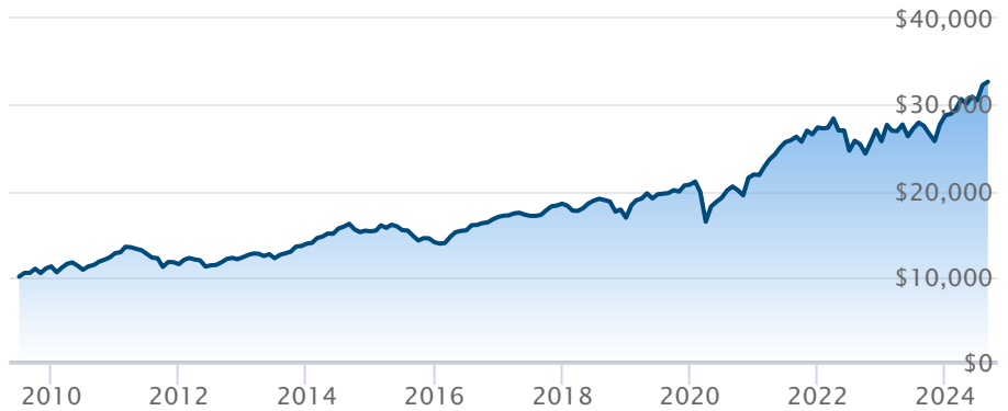
BMO S&P/TSX Capped Composite Index ETF (ZCN)