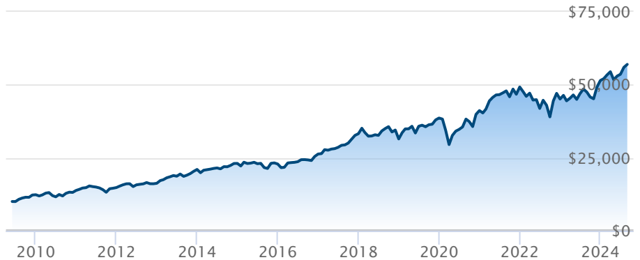
BMO Dow Jones Industrial Average Hgd to CAD (ZDJ)