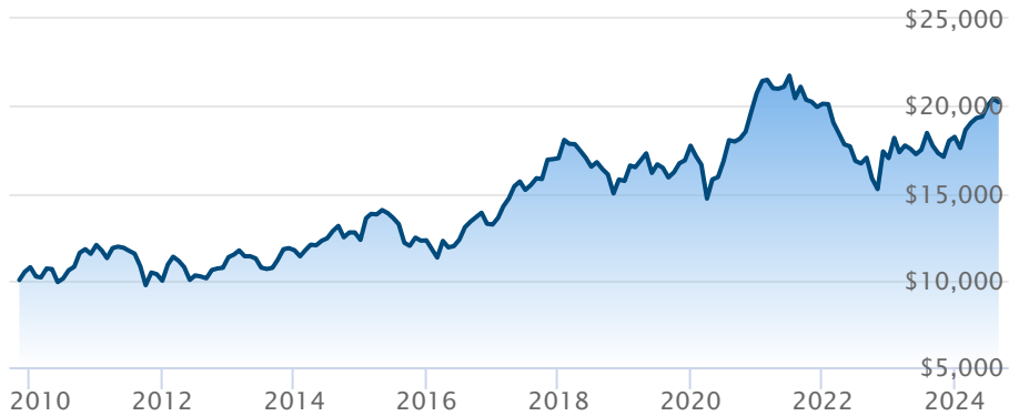
BMO MSCI Emerging Markets Index ETF (ZEM)