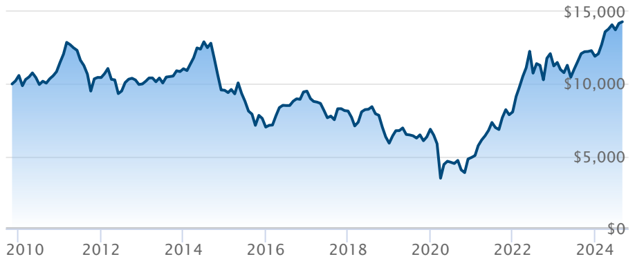
BMO Equal Weight Oil & Gas Index ETF (ZEO)