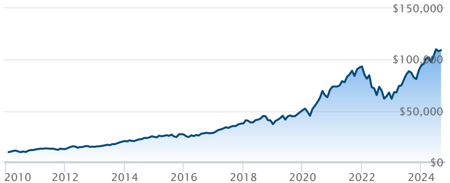
BMO Nasdaq 100 Equity Hedged to CAD Indx ETF (ZQQ)