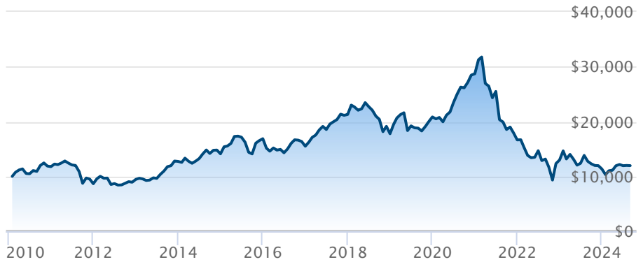
BMO MSCI China ESG Leaders Index ETF (ZCH)