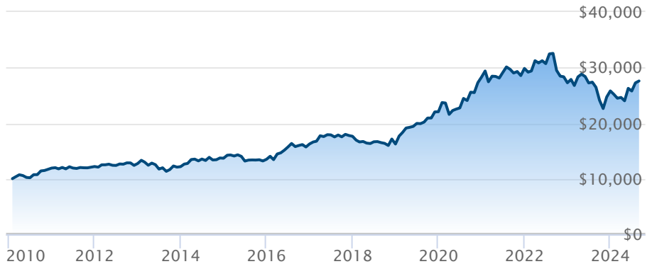
BMO Equal Weight Utilities Index ETF (ZUT)