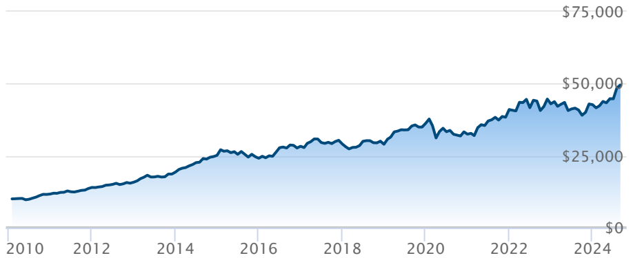
BMO Global Infrastructure Index ETF (ZGI)