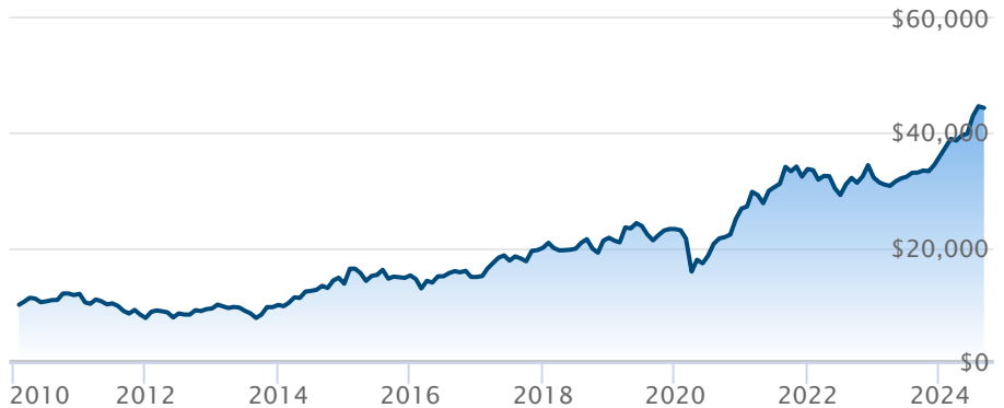
BMO MSCI India ESG Leaders Index ETF (ZID)