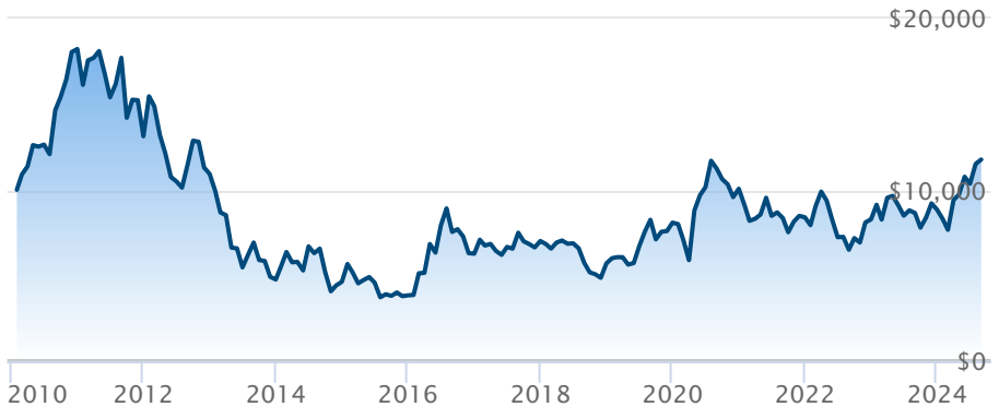
BMO Junior Gold Index ETF (ZJG)