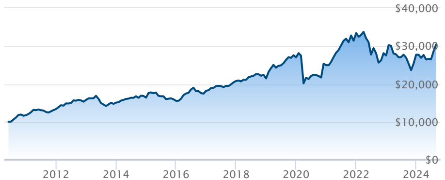
BMO Equal Weight REITs Index ETF (ZRE)