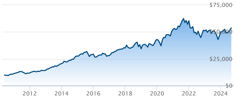
BMO Equal Weight US Health Care Hgd to CAD (ZUH)