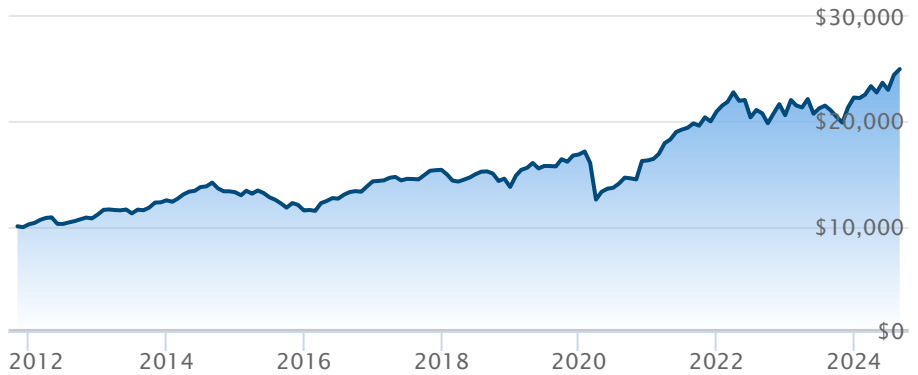
BMO Canadian Dividend ETF (ZDV)