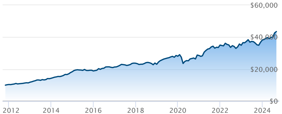
BMO Low Volatility Canadian Equity ETF (ZLB)