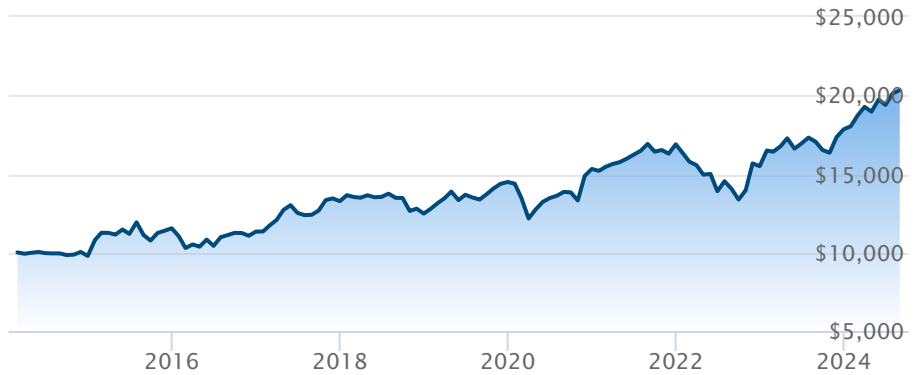
BMO MSCI EAFE Index ETF (ZEA)

Past performance is no guarantee of future performance. All returns are historical annual compounded total rates of return and reflect changes in yield and distributions reinvested. Managed Indexed, Managed Portfolios and Market Indexed accounts credit an interest amount mirroring the net rate of return of a specified underlying investment, less a BMO Life Assurance Company daily management fee. These rates of return do not reflect the current BMO Life Assurance Company management /universal life fee which must be taken into consideration when determining the net return earned on the account.