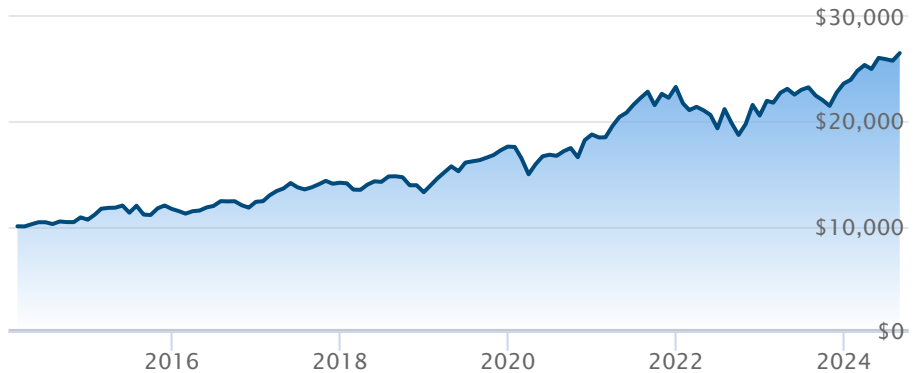
BMO MSCI Europe High Quality Hgd C$ Idx ETF (ZEQ)