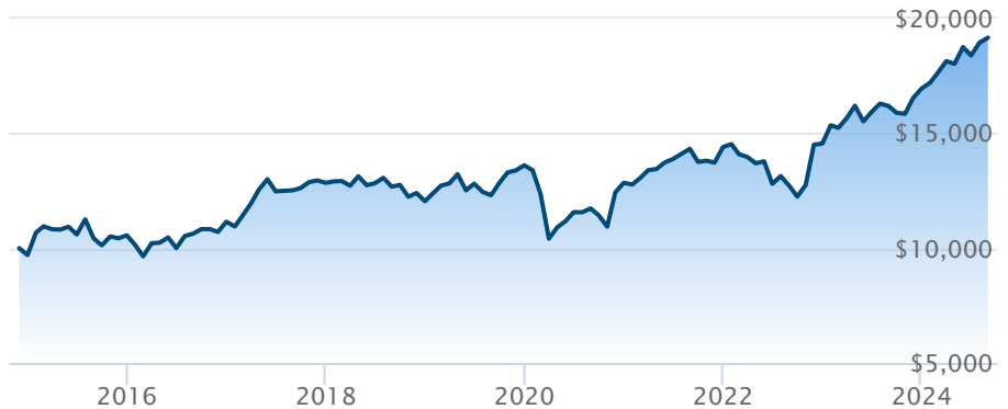
BMO International Dividend ETF (ZDI)