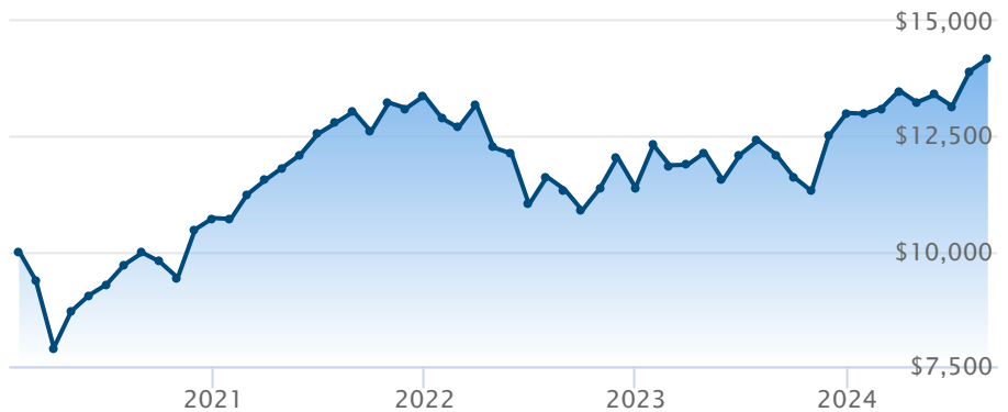
BMO MSCI Canada ESG Leaders Index ETF (ESGA)