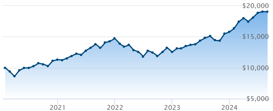
BMO MSCI USA ESG Leaders Index ETF (ESGY)